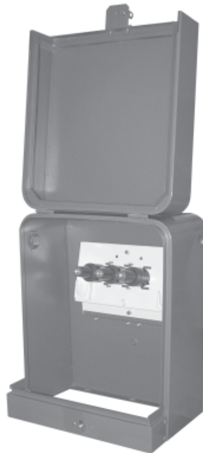
FIGURE 1: Single-phase junction enclosure (shown with optional switching module installed)